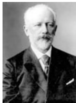
Pyotr Ilyich Tchaikovsky